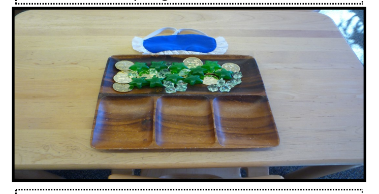
Sensorial; sort objects- color, size, shape