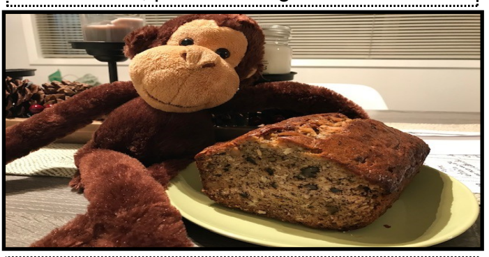
Language; Stuffy vs Monte-directions attached