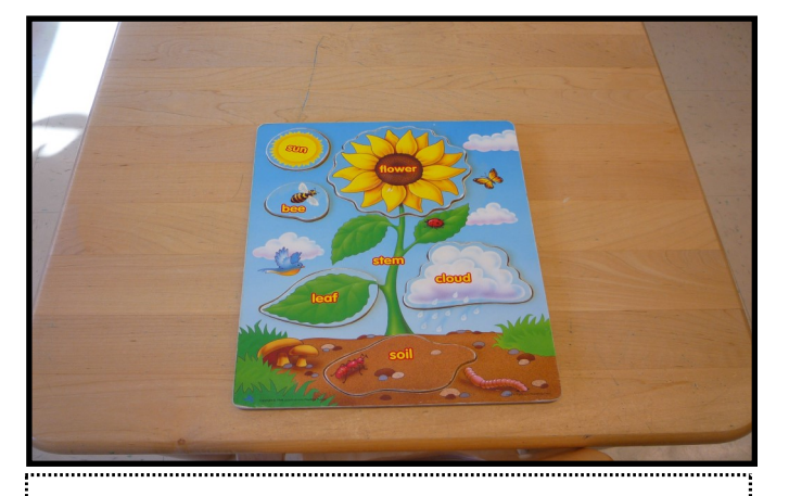
Botany; Parts of a flower; printable attached

Music; 5 little ducks song— see video on our website via Facebook!