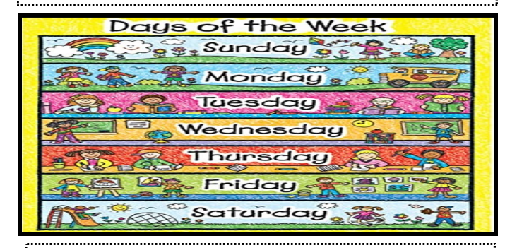
Days of the week- write each day