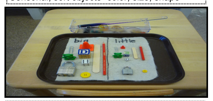
Math; big and little-size, comparison