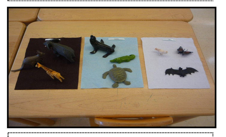
Science; land, air, water in picture above