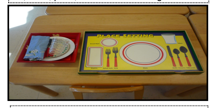
Practical Life; place setting