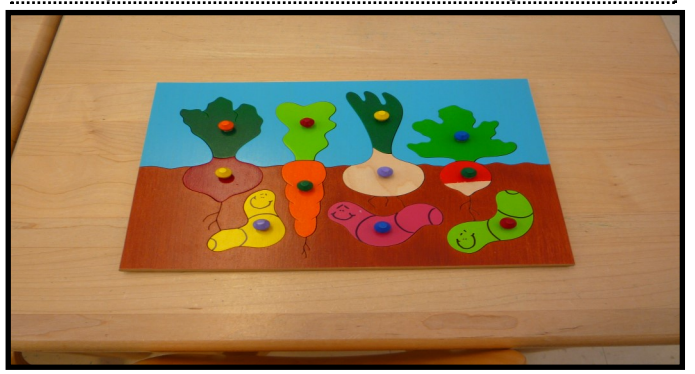
How do fruits and vegetables grow? On a tree? On a vine? Underground?

Music; The pie song – see video on our website via Facebook!