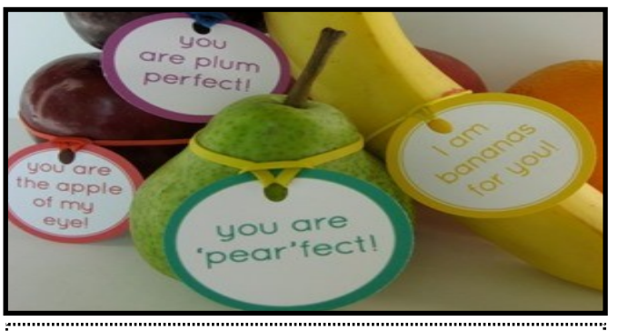
Language; Tell a fruit or vegetable joke