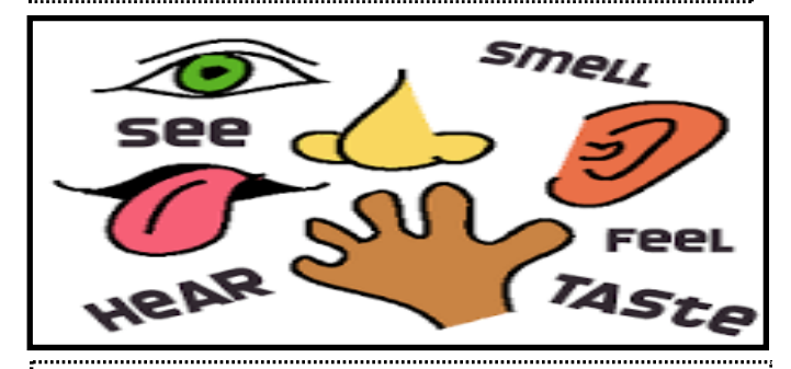
Sensorial; 5 senses with fruits and vegetables