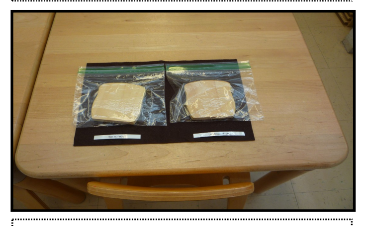
Science; Moldy bread experiment