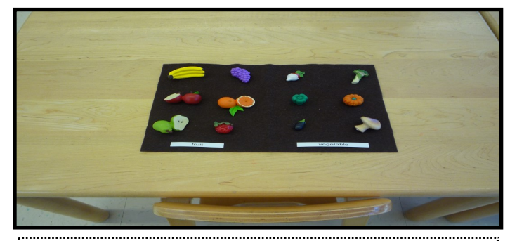
Art; draw, paint, color- fruits and vegetables