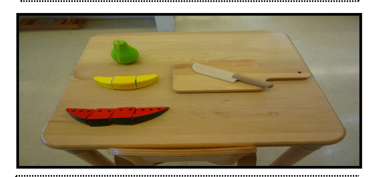
Math; whole, half, quarter